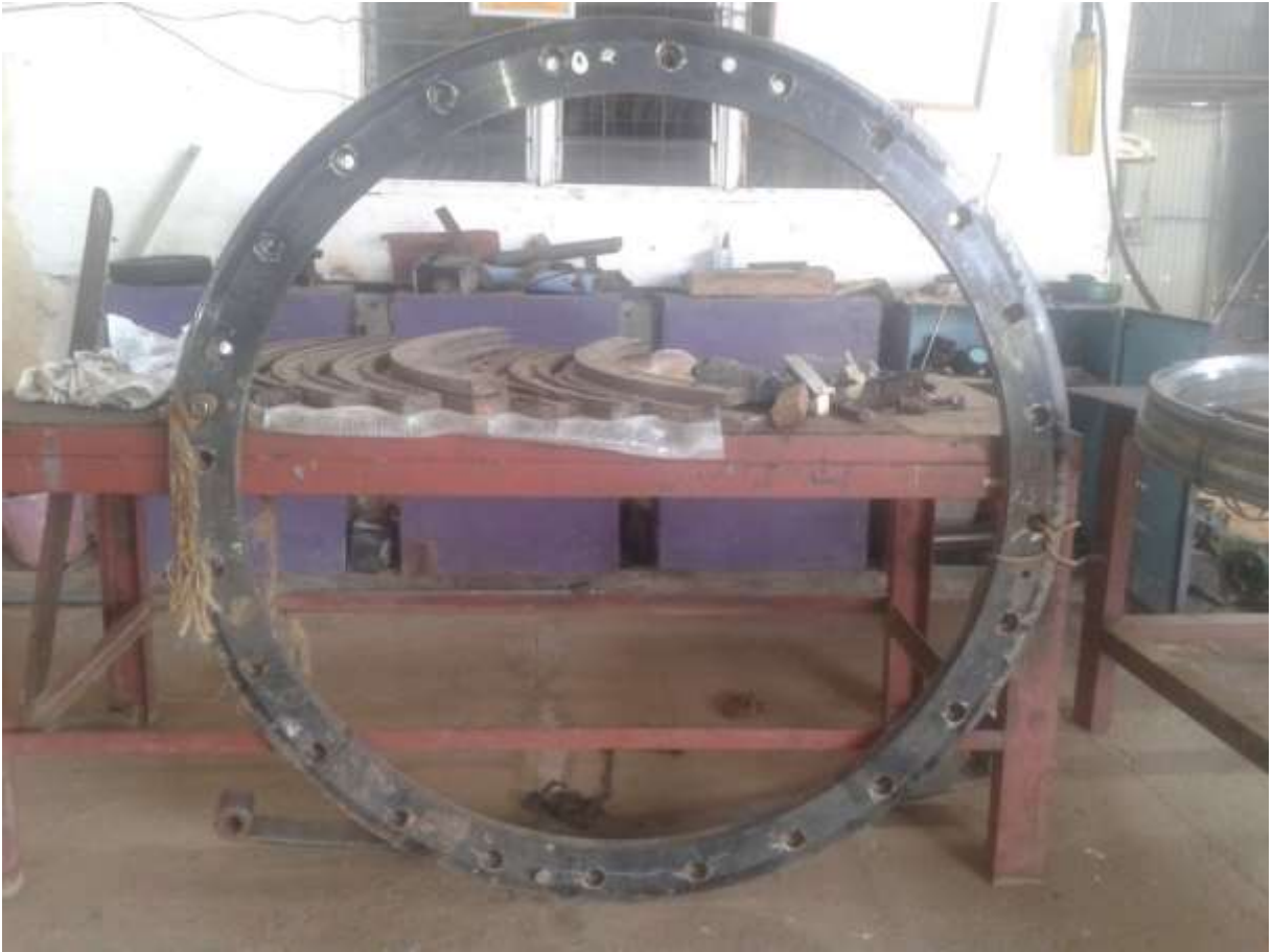
Fig:3 MIV stationary ring