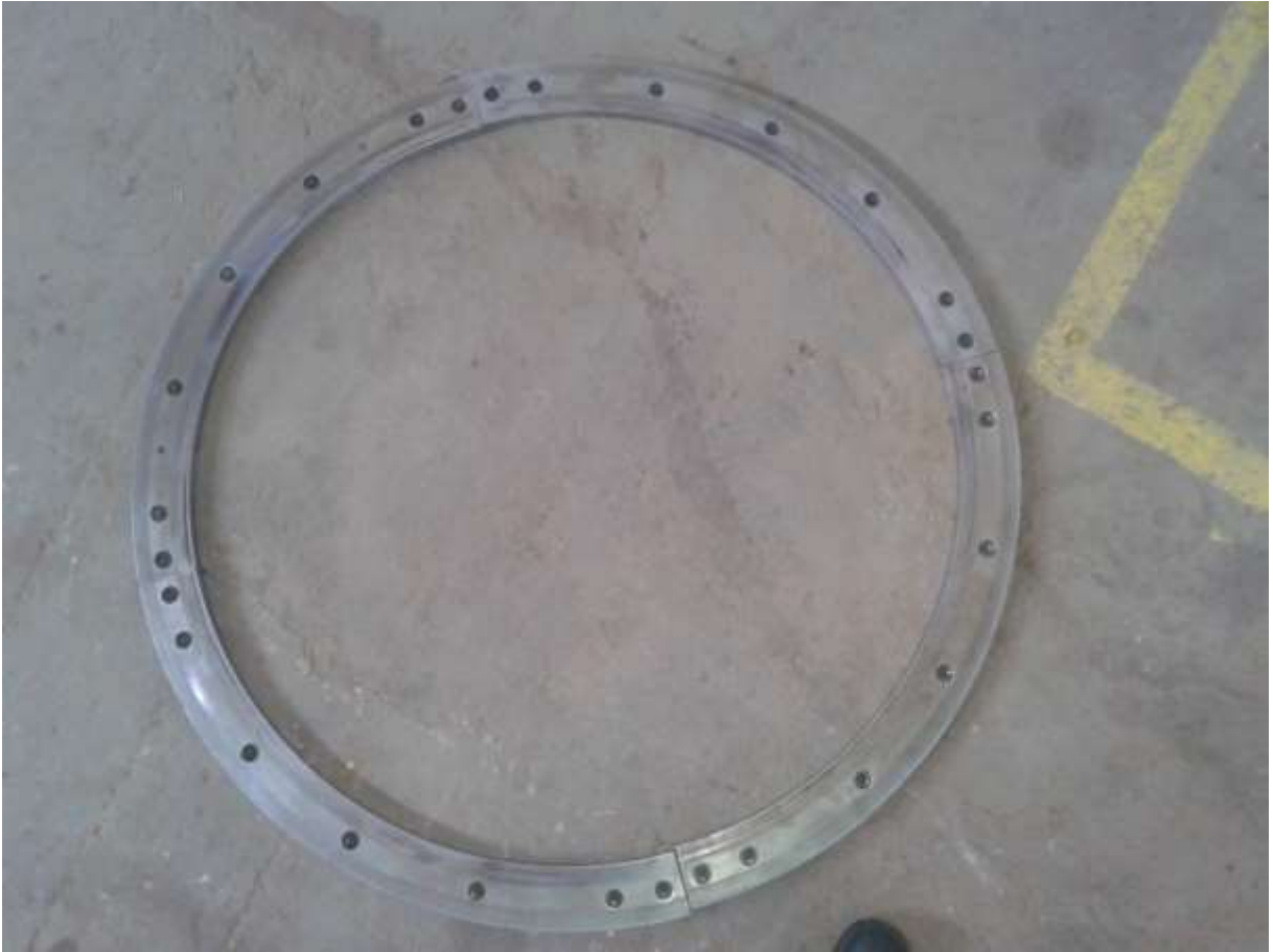
Fig 1. Shaft seal runner plate segments