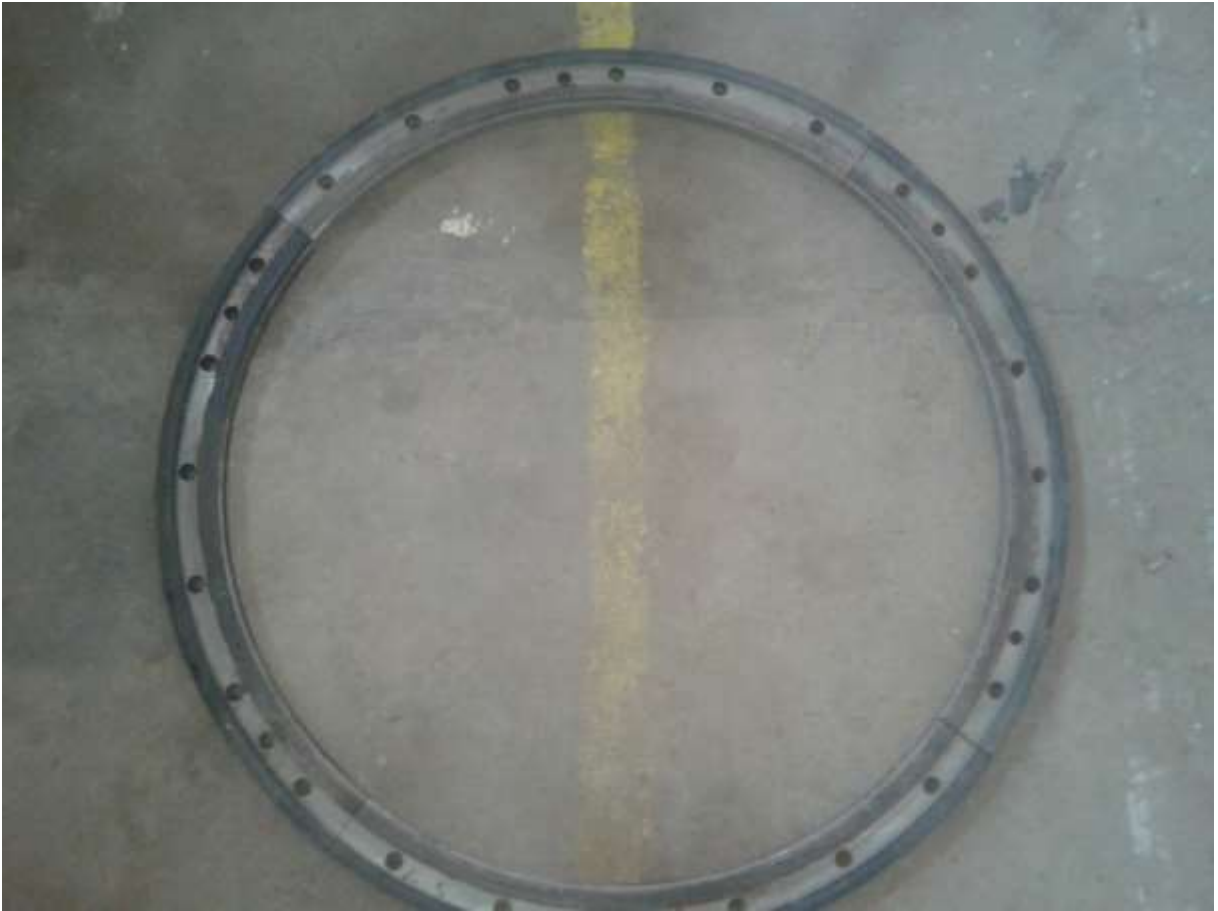
Fig2: shaft seal carrier segments with carbon